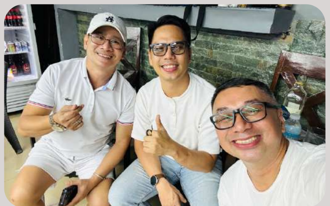
RAC CENTRAL BUTUAN'S YEAR-END PARTY