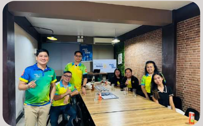
14TH REGULAR CLUB MEETING